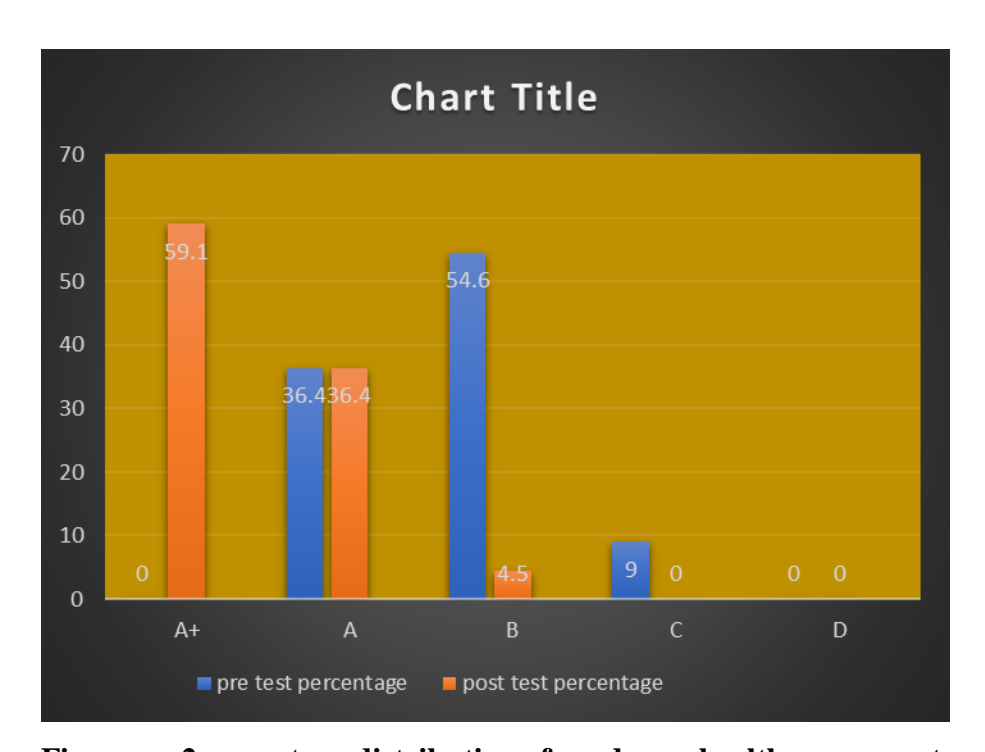
Figure no 2percentage distribution of grades on health assessment among faculty